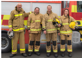
year's award recipients